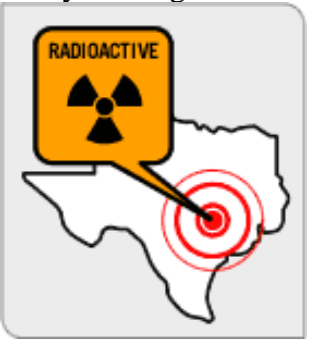
Austin is radioactive, move to Houston

If your lungs and stomach start talking, stand with your arms akimbo until they stop.